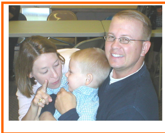
Church breakfast on Sept. 13, 2009